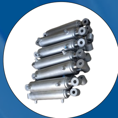
REAR AND FRONT CLEVIS MOUNT